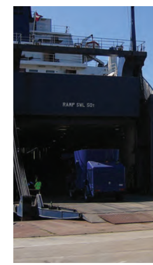
The diversity of activities at the Port of Karlshamn is a strength in many ways:

1. For customers in the region, it means access to a fully qualified port with full service.