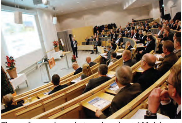
The conference brought together about 100 delegates

The main themes were business opportunities in eastern Europe, regional experiences and opportunities for trading possibilities with